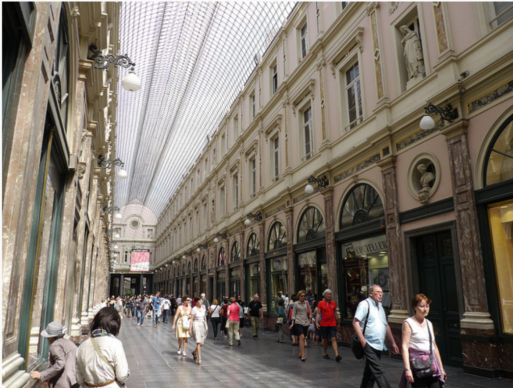
Galeries Royales Saint-Hubert.