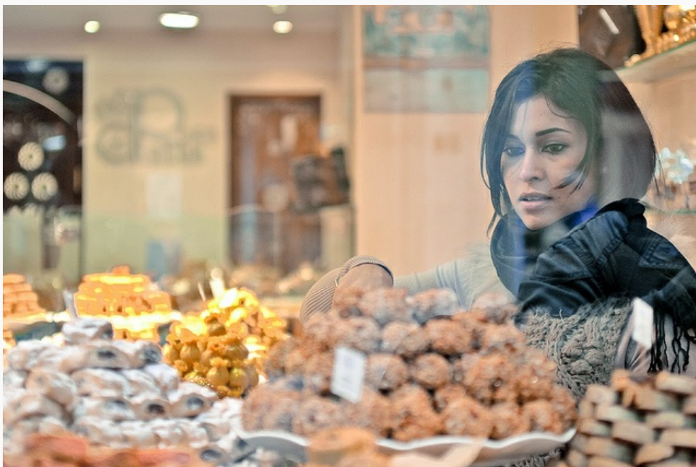
Chocolate shop, Brussels.

If you like buying or simply browsing second-hand books, another shop worth visiting is Nijinski, near Place du Châtelain. Named by its former owner after the Russian dancer Vaslav Nijinski, the store is on the ground floor of a beautiful old mansion. It offers a cozy setting where book lovers can explore a great selection that includes classics, foreign literature, humanities, and fine arts. Unlike other second hand and antiquarian bookshops in Brussels, Nijinski contains a sizable selection of volumes in foreign languages, not only in English but also in German, Russian and Italian. Worth mentioning are the tastefully and carefully arranged window displays on both sides of the entrance.