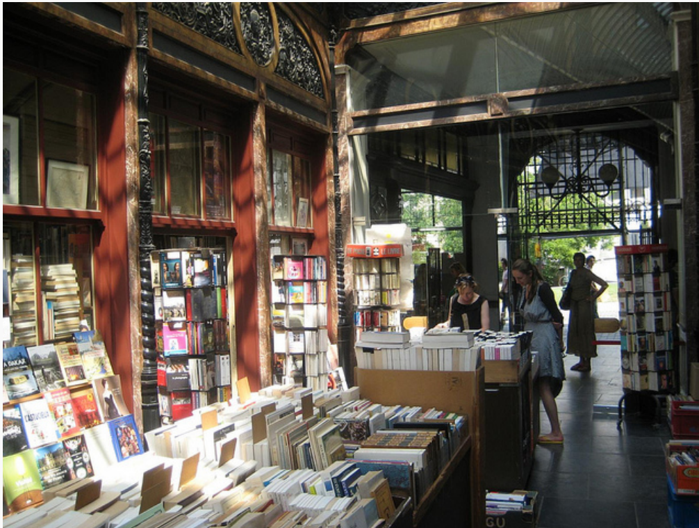
Brussels Galerie Bortier.

If you like buying or simply browsing second-hand books, another shop worth visiting is Nijinski, near Place du Châtelain. Named by its former owner after the Russian dancer Vaslav Nijinski, the store is on the ground floor of a beautiful old mansion. It offers a cozy setting where book lovers can explore a great selection that includes classics, foreign literature, humanities, and fine arts. Unlike other second hand and antiquarian bookshops in Brussels, Nijinski contains a sizable selection of volumes in foreign languages, not only in English but also in German, Russian and Italian. Worth mentioning are the tastefully and carefully arranged window displays on both sides of the entrance.