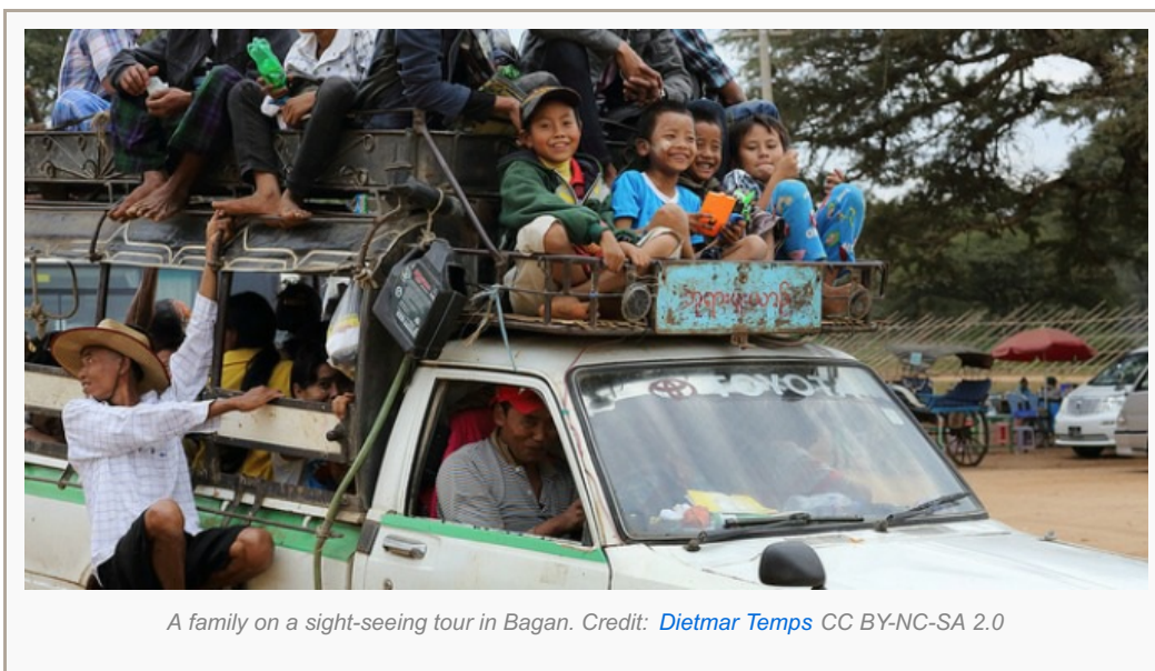
A family on a sight-seeing tour in Bagan.