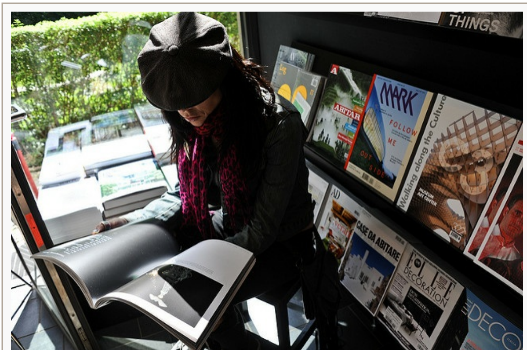
do you read me? bookshop , Berlin.

For anyone who finds themselves in need of a quiet spot in the middle of Berlin, or a magazine or book in their native tongue, do you read me?! is the place to go. Refreshingly modern, with sleek books and magazines on black shelves, the bookstore caters to foreign travellers as well as Berlin's large ex-pat population. The store offers a reading room to host book and poetry readings as well as lectures and meetings, and its newer satellite store takes up a corner of a larger space in West Berlin. The main store in particular offers a thorough range of contemporary literature, from social critiques to Vogue , while maintaining a polished yet welcoming atmosphere in which to browse.