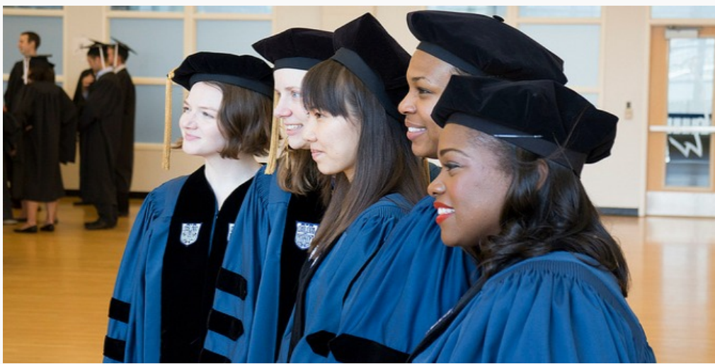
PhD students graduate at Duke.