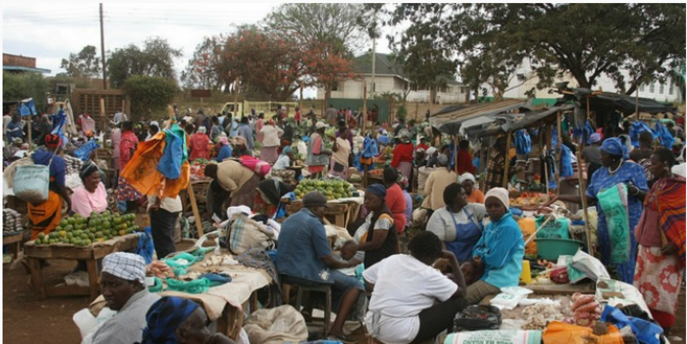
Loitokitok market, Kenya.

in illicit or informal economies, which in times of stability are often not traditionally recognised as belonging or 'having a place' at all.