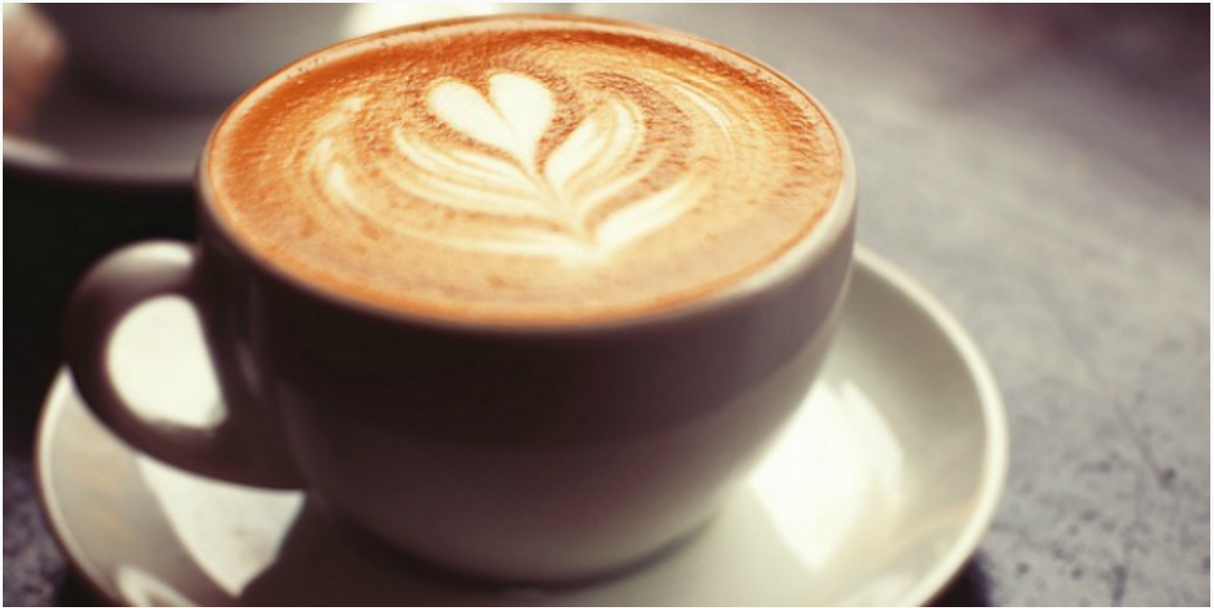
Coffee in 12 Corners, New York.