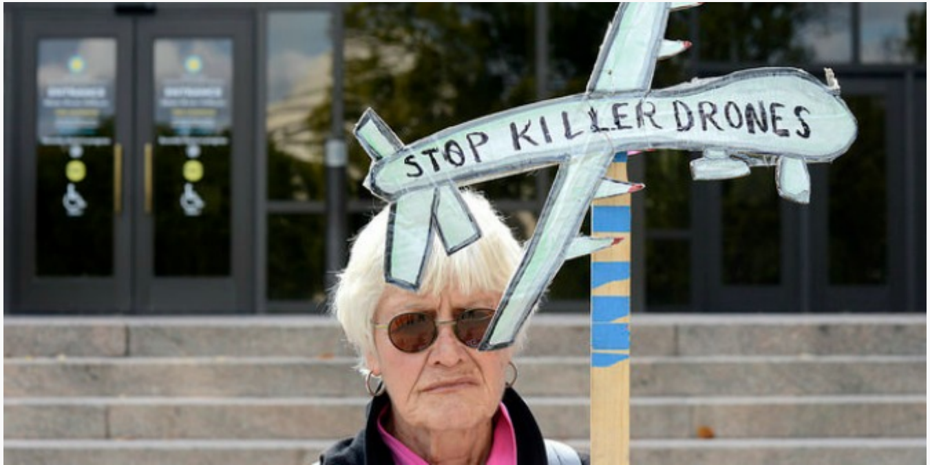
2014 Global Day Of Action Against Drones.

Chapter 3 focuses on the other widely debated topic within the discussion on drones: the legality of the use of UAVs. This includes a more specific analysis of whether killing alleged terrorists with this type of weapon is in compliance with the Jus In Bello framework. At the same time, it also considers the use of drones in situations where the threshold of an armed conflict will usually not be reached, which is then seen as the use of drones for the purpose of law enforcement. The laws applicable to law enforcement situations will generally make it more difficult to use drones for lethal purposes. At times, this chapter reflects the debate on the general principles of international humanitarian law rather than discussing the application of the laws of war on drone warfare. This is the stage where Rae focuses more specifically on the legality of targeted killing in counter-terrorism activities.