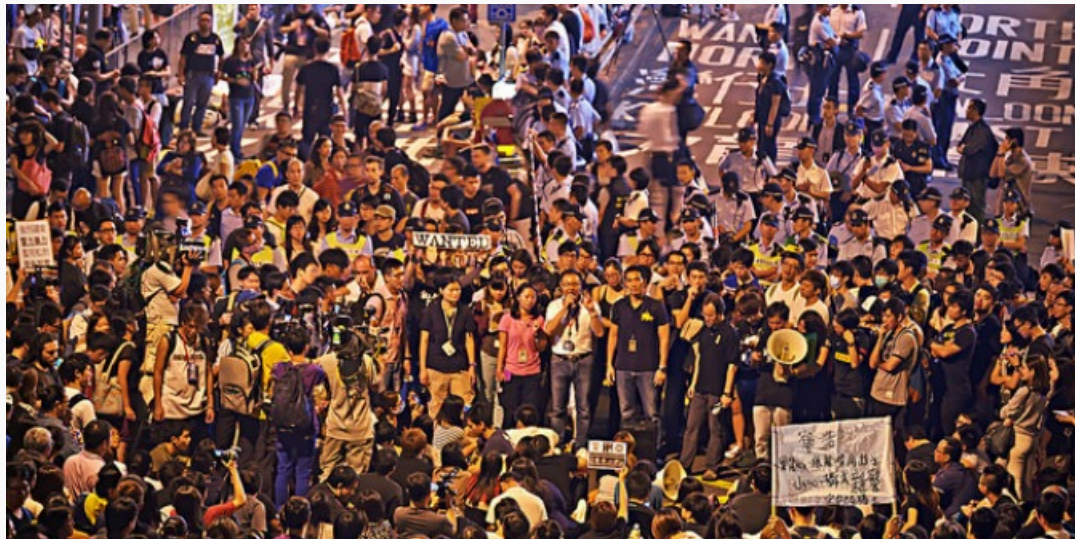
Protesters in Hong Kong.

also has della Porta as one of the editors, may be more suitable.