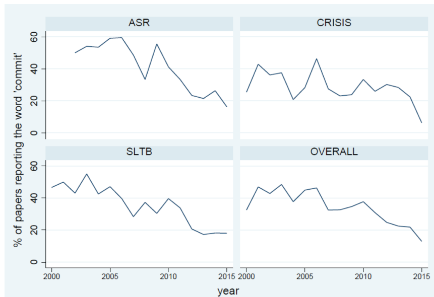
Figure 1. Percentage of papers reporting 'commit*' in relation to suicide or self-harm behaviours, by journal (2000–2015), p -value for trend < 0.001 . Note: Instances in which 'commit*' is directly quoted (e.g., in qualitative interview data that is reported to support a theme) are excluded from this count. ASR, Archives of Suicide Research; SLTB, Suicide and Life-Threatening Behaviour.

As individuals we each hold a position of power and responsibility. As researchers, clinicians and suicidologists we hold a collective responsibility for the language we propagate and the messages this imparts. Therefore, we believe that the phrase 'commit suicide' should be avoided in all arenas, including clinical and professional practice, teaching, when interacting with peers, colleagues and the general public, in our everyday lives and, importantly, in our academic writing. While it is noted that in the 25 countries in