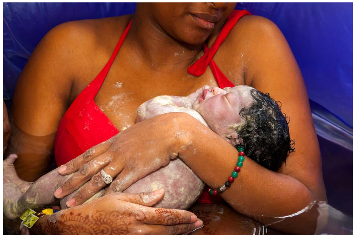
Going it alone.