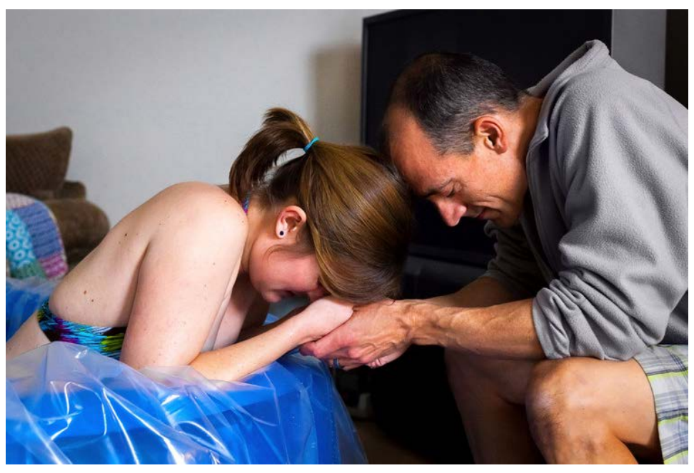
Some women prefer to give birth at home among family, rather than in front of maternity professionals - and that's their right.

The decisions made at both ends of this spectrum challenge the basis on which our current healthcare provision around childbirth is offered.