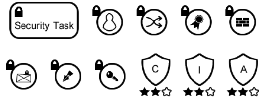
Fig. 5. Koh and Zhou security notation

harm protection, encrypted message, non-repudiation and secure communication respectively left-to-right. The final three symbols represent confidentiality, integrity and availability. With the stars visualising the required level for each concept.