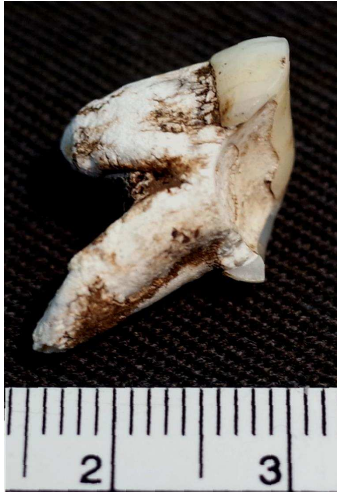
Figure 3. Steeply-angled wear on an upper left second molar (U.W. 101-528).