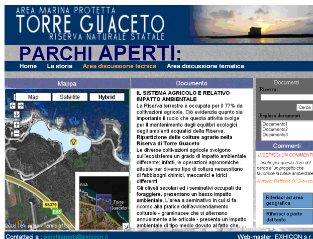
Figure 1. MESS: the interface in the Argumentation Support module

In MESS, by tracing the process history, knowledge is stored in a dynamic format following the decision process dynamics: knowledge is embedded in the process and the process is used to structure knowledge. At t = t_n , a set of argumentations (based on observations/argumentations and related comments) is associated with the current decision making hypothesis and can activate the transition from that hypothesis to the subsequent.