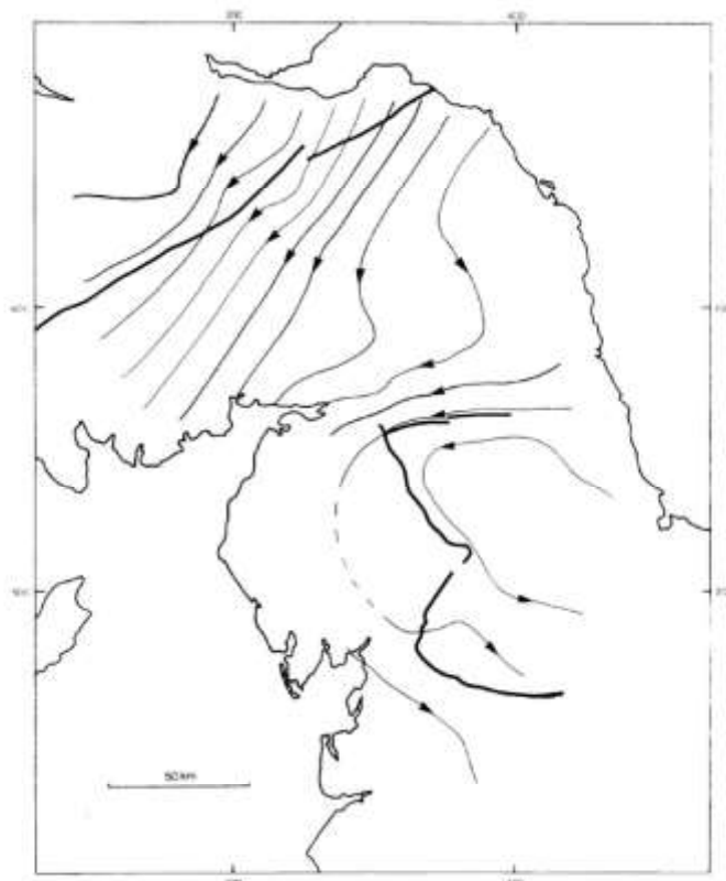
Fig. 3 The current stream function in a thin sheet at a depth of 5 km, derived from Fig. 2. Approximately 10 A flows between the stream lines when the amplitude of the horizontal magnetic field is 1 nT.

at Eskdalemuir, where the anomalous character of the variation fields was first detected, lies where the anomalous fields of the two structures merge. The Northumberland Basin anomaly is very well defined by the dense network of IGS/Lancaster stations. The southern edge of the anomalous current concentration coincides with the northern margin of the Weardale granite, which underlies the Alston Block. When the current sheet is placed at depths in excess of 5 km, the current stream function becomes unstable, indicating that at least part of the actual current is shallower than 5 km. Magnetotelluric measurements at a site in the Northumberland Basin 11 also indicate a shallow conductor, although they are not conclusive because the sounding is close to the southern margin. The variation in depth of the pre-Carboniferous basement within the basin has been established by seismic refraction and gravity surveys 14 . The sediments are at their thickest (up to 3 km) towards the southern margin, where the current density is greatest. Taken together, these facts suggest that the current responsible for the magnetic variation anomaly is concentrated principally in the relatively conductive Carboniferous sedimentary rocks of the Northumberland Basin.