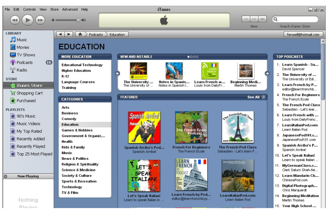
Figure 1: Podcast directory from iTunes . Podcasts are classified by categories and can be searched. The education category lists all educational podcasts and includes a section for language courses.