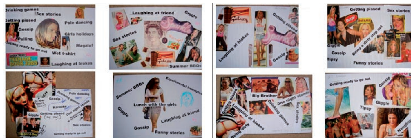
Lambrini storyboards used during company market research in London. Left: under 23 year olds. Right: over 23 year olds w14

One producer recognised that this presents a dilemma. An evaluation of Smirnoff’s Facebook w42 presence showed that almost three quarters of members of Smirnoff related groups belonged to groups where there is a significant