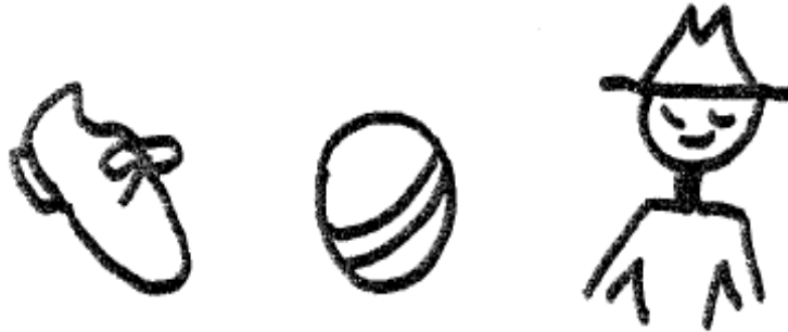
Figure 1. Examples of logographic symbols