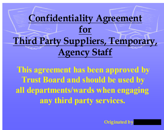
Figure 1. Privacy screen saver.

A selection of screen savers were then selected and put on the system. However, after a period of time user complaints still arose about these screens, e.g. “what do I want to look at somebody’s holiday snap for and what do I want to look at this and that for?”. It was then decided by the screen saver development team that the resource would become an information board. There was a marked decline in complaints after this point and a dramatic increase in user involvement. Initially the application cycled through IT security advice screens (see fig 1) e.g. securing personal data, incident reporting etc.