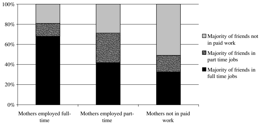
Figure 2. Employment status of majority of three best friends by employment status of mothers: all mothers with pre-school children.

are themselves mothers of pre-school children (longer dashes). These proportions show a steadily falling trend as the proportion of mothers of pre-school children in employment (the solid line on Figure 1) rises.