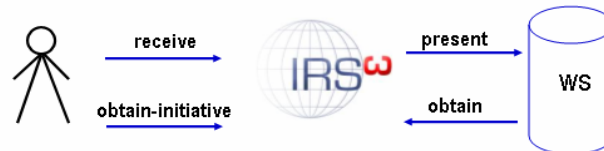
Fig. 1 A typical sequence of choreography events occurring during goal based web service invocation in IRS-III.

Figure 1 depicts the event sequence for this typical goal driven web service invocation scenario.