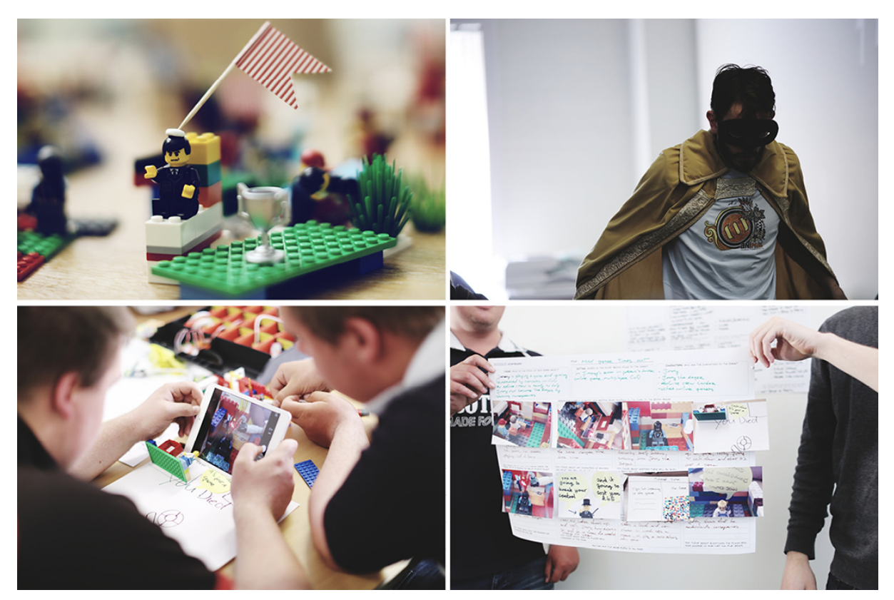
Figure 3. Narrative tools and metaphors used to capture the lived experiences of participants along with their learning needs and gaming preferences during the co-design sessions.

benefits they could gain by using the learning tool. It also helped to create a more equal platform for the young people to work directly with project partners and researchers, whilst the presence of the trainers provided a sense of familiarity and enhanced support.