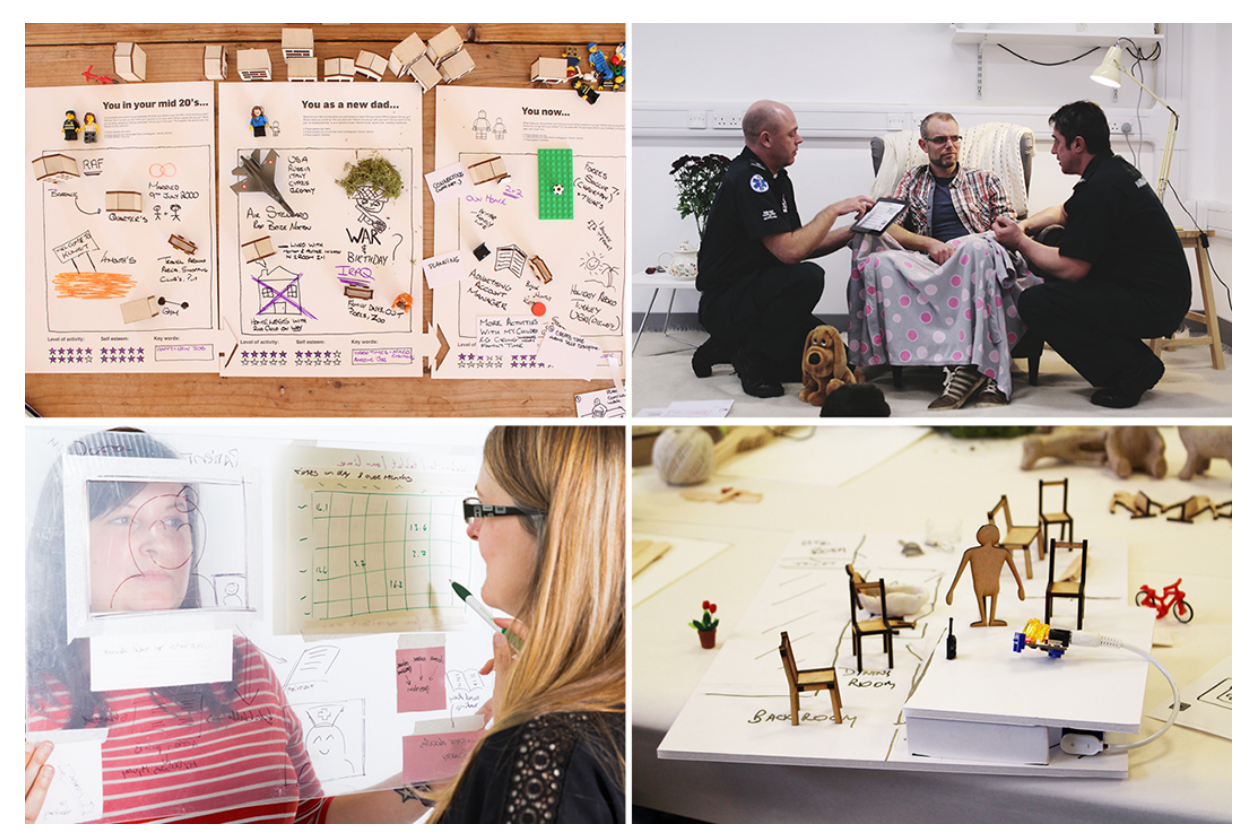
Figure 1. Activities and tools used across various Experience Labs projects to capture lived experiences of participants and support ethical imagination to create preferable futures.

When exploring multiple futures that might be considered equivalent in terms of functionality and usability, there can be a moral basis for choosing between alternative design decisions (Robertson, 2006 cited in Robertson and Wagner, 2013). In the Labs participants engage an ethical imagination to create preferable futures which meet the needs of multiple stakeholders. Participants engage explicitly and implicitly in ethical decision-making through trialling imagined actions and exploring the potential consequences, resulting in an amalgamation of ideas and shared decisions (Lloyd, 2009). Realistic settings are created to allow for the trialling of scenarios and actions, and make visible the implicit ethical considerations that underpin and inform the decision-making process. Bespoke design tools and artefacts assist people in embodying an imagined future world which has reference points to the real world. The activities and tools are modelled, practised and nurtured to support all those who are involved to feel safe to participate fully and comfortable to take risks (Bryan, 2004 cited in Miell and Littleton, 2006). A variety of tools such as scenario boards and experience maps are used to enable participants to synthesise their current lived experiences, and gradually transition towards imagining preferable futures. The activities and tools are informed by core values that support participants to engage in an ethical imagination and nurture collective decision-making.