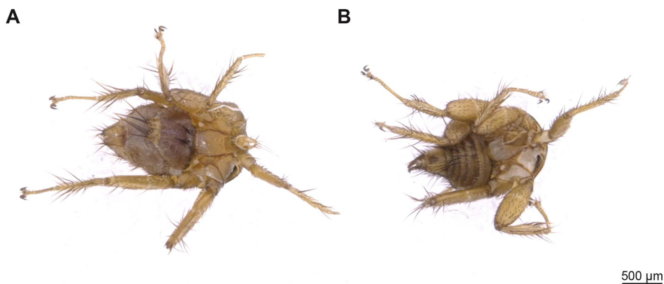
Fig. 3. Basilina mediterranea Hürka, 1970. A: male (Montecristo Island); B: female (Capraia Island).