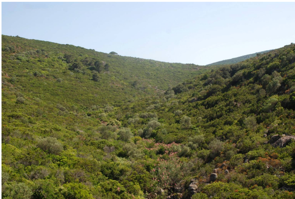
Fig. 2. Capraia Island characterized by typical Mediterranean vegetation.

Basilina mediterranea was almost exclusively collected on specimens of Pipistrellus pipistrellus and only occasionally on other bat genera (e.g.: Hypsugo savii Bonaparte, 1837) (LANZA, 1999). The species has Western Mediterranean distribution. It has never been reported for Italy despite a finding in the close island of Corsica (LANZA, 1999). However, Basilina italica , is the only species of Basilina found up to now in Italy (SZENTIVÁNYI et al. , 2016).