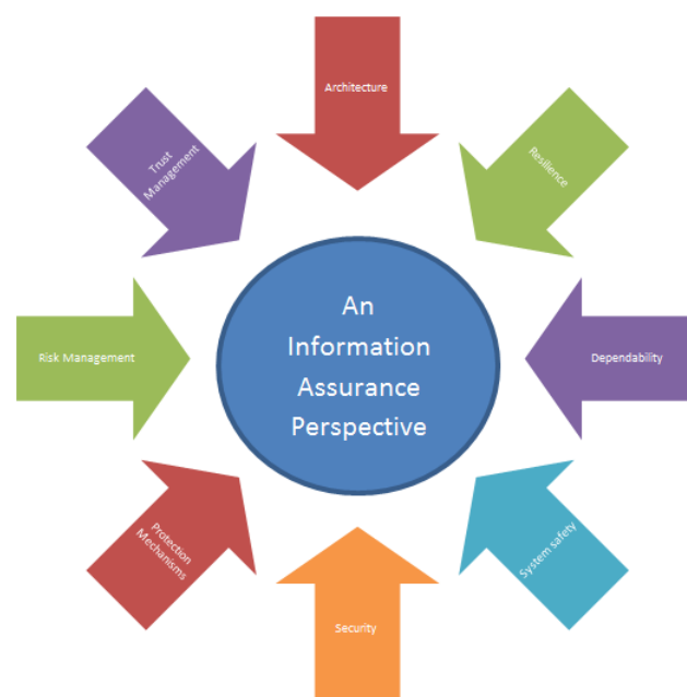
Figure 1: Dynamic Attributes of Information Assurance

There is a plethora of regulatory compliance requirements in place to try to protect digital businesses and their customers. However, being merely compliant is no longer sufficient; cyber resilience posture must be adopted in order to ensure success when operating a hyperconnected enterprise [5]. In order to survive and ensure longevity, these businesses must be constantly evolving, being able to quickly adapt and/or react to the ever changing landscape and have the ability to recover rapidly from unforeseen events.