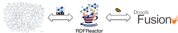
Fig. 1. The runtime workflow diagram.

In brief, the results of work done at design time contain: i) an application oriented event model, ii) Java libraries for manipulating event model and processing results, iii) the specification of rules for event processing. All of these are inputs to the runtime modules, which work following the flow illustrated by Fig. 1. Event streams are formed by executing SPARQL CONSTRUCT queries