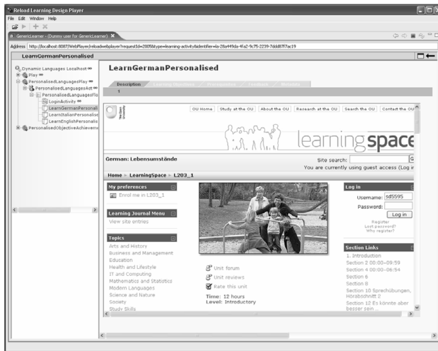
Fig. 4. Reload IMS LD Player while dynamically invoking SWS to retrieve appropriate learning content

the retrieved learning object identifier is used to obtain an Open Learn learning unit appropriate to the individual language of the learner and its current objective. The retrieved learning object is finally presented in the IMS LD runtime environment.