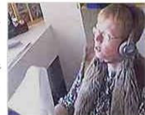
Figure 4: Transcript data corresponding to audio and video data recorded from the remote observation exercise for the Excel spreadsheet

The upper left-hand corner of the figure shows the practice question whilst the upper right-hand corner shows the Excel spreadsheet that both the researcher and the student can see. Below this, a transcript of the student's utterance is shown along with the timeline in the experimental period. The actions of the student are also noted after the experiment. These actions, such as the clicking and entering of data, can be seen from watching the screen capture video, whilst the actions such as reading printed materials are noted through the webcam video. A webcam picture of a student reading printed materials is shown to the side of the transcript. In this particular episode, we note that in this practice question the student is looking at the black-box spreadsheet and there seems to be some confusion as to what to do. The data shows that from time 14:17 upon entering the black-box calculator spreadsheet, the student decides to read back