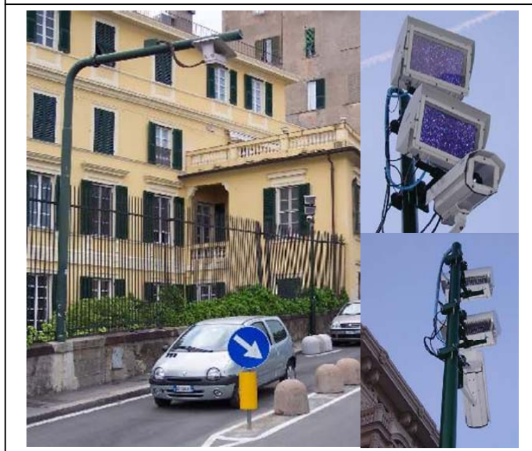
Figure 5: One of the entry gates in Genoa with similar type cameras and OCR equipment enlarged on the right. (PI)

The future for Genoa’s Access Control scheme evolution to road pricing depends on a number of objectives and work packages associated with achieving the overall aims. The following, constitute a brief summary of the objectives set by the Municipality of Genoa (Comune di Genova, 2004) in their projected activities towards a system of tariff-based access control. The report also includes a detailed list of complex and interrelated work packages (approximately 23) covering all aspects of the system. It was evident that this project was more than just an ‘experiment’ and that there was a strong focus in defining the entire focus of the system through analysis. The depth of consideration shows that the municipality is earnest about advancing the policy to a full-scale implementation.