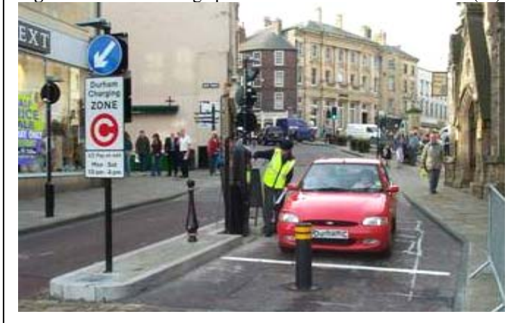
Figure 3: The exit charge point from the Durham Peninsula. (PI)

The area had particularly acute traffic problems. Of the 3000 vehicles that entered the area each day prior to the scheme being adopted, 50% used the road to as a mobile parking area thus contributing short-term to congestion by slowing down traffic. Congestion was high because of the sheer number of vehicles and pedestrians concentrated in a small street – around 13,000 each weekday and 17,000 on Saturdays (DCC, 2000). The situation in the area was untenable, threatening the viability of local businesses and damaging the appeal of the Durham Peninsula as a World Heritage Site. A key part of introducing the congestion charge was the provision of alternative means of access to the Peninsula, and discussions with public transport users resulted in the launch of a new minibus service that began operating some two months before the congestion charge was introduced (DCC, 2002a). Part-funded by the congestion charge, the ‘Cathedral Bus’ was selected to provide accessibility to the mobility impaired and links the Cathedral and Market Square with the Rail, Coach Stations and a Park and Ride Car Park every 20 minutes. Overall, the cost of the project to implementation including the operating systems, buses and pedestrian improvements was £250,000 (€365,000), and was funded entirely through the Council's Local Transport Plan (LTP) settlement.