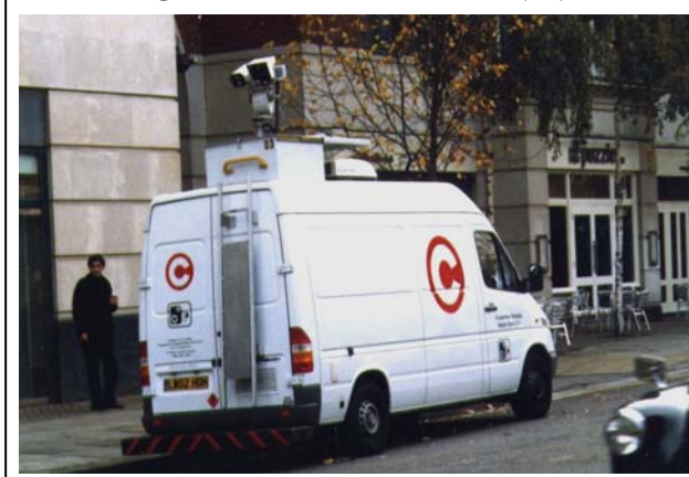
Figure 1: A mobile camera unit (SP)

The traffic impact outside the congestion charging zone has, contrary to expectations, been minimal. To accommodate modal transfer, 300 additional buses, offering 11,000 places were added to the already extensive bus network of London increasing bus usage by more than 7%. Making radical improvements in bus services was one of the Mayor's ten priorities for transport in London (TfL, 2004). The scheme also generated net revenues to generally improve transport in London. Plans for a possible extension of