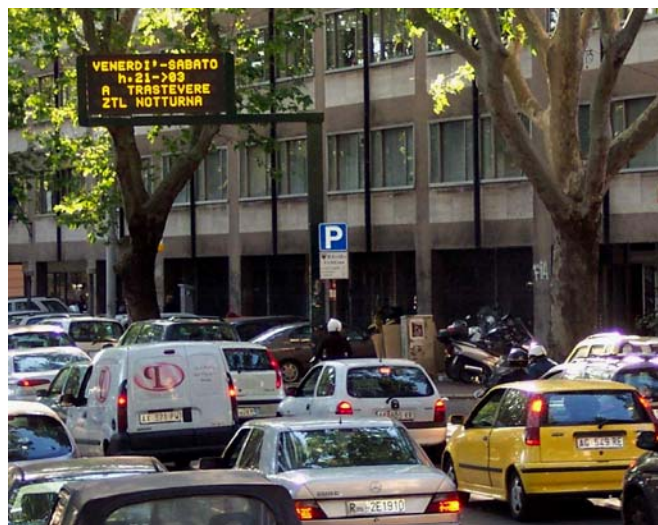
Figure 4: An overhead VMS (Variable Message Sign) warning of the ‘nocturnal’ access control scheme in Trastevere in May 2004. (PI).

The main objectives of both experiments were to provide a more enjoyable and safer environment for pedestrians accessing the two areas and test if the traffic limiting measures had a positive effect on business. Access to the areas was complemented with extra night bus and tram services – two for Trastevere and one for San Lorenzo – that provided access to and from nearby parking areas. In addition to the road pricing scheme, Rome introduced ‘spatial’ parking charges based on the principle that parking gets more expensive the closer it is to the city centre. The idea is to encourage parking at the periphery in order to reduce inner city congestion.