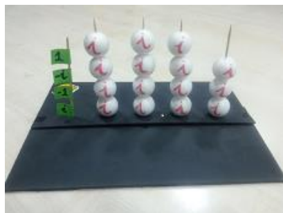
Figure 1: Example provided by Esra as a creative manipulative

Esra gave another creative activity example for group work—the manipulative—which was developed by the prospective teachers, and is displayed in Figure 1.