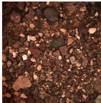
Fig. 3. RGB visible light reflectance image taken from the rover showing rock characteristics (image is 10 cm wide).

Methodology/Strategy: The primary strategy for this experiment was to identify, map, characterize, and sample prime candidate sites that have the greatest biological potential within and surrounding the landing ellipse through combined satellite-, field-, and microscopic-based perspectives, and long-range roving. Pre-traverse Satellite Reconnaissance: the pre-traverse, satellite-based reconnaissance included mapping: (a) the geology and geomorphology in and surrounding the landing ellipse such as distinct map units (e.g., fan, basin, fluvial, etc.), geomorphic characteristics (valleys and valley networks), and tectonic structures (faults and structurally-controlled basins), since these may be representative of potential habitats (geology often correlates with biology, (b) specific mineralogic signatures identified using thermal emission spectra, which may indicate ancient/recent aqueous activity, including weathering and secondary mineralization, (c) geologic materials