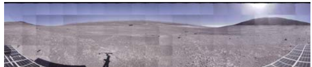
Fig. 2. Panorama taken from the high-resolution imager onboard the rover.