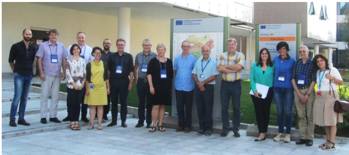
Figure 2 Invited experts and JRC participants to the workshop.

In order to ensure dissemination of the results of these activities in both communities (INSPIRE and energy efficiency of buildings), a proposal will be made to the organizers of the INSPIRE conference next year (early September 2017) to devote time and effort to have the building energy society involved in, e.g. Theme on Energy in Built Environment . DG ENER and DG ENV could be contacted to elaborate this proposal, taking into account the relationships of the energy related Directives, such as the EPBD, the EED and the voluntary initiative of the Covenant of Mayors with the INSPIRE Directive. The DGs that could be involved are DIGIT (the ISA 2 programme), ENV (INSPIRE), ENER (Smart Cities), RTD, GROW and JRC (research on INSPIRE, location interoperability and support to energy policy).