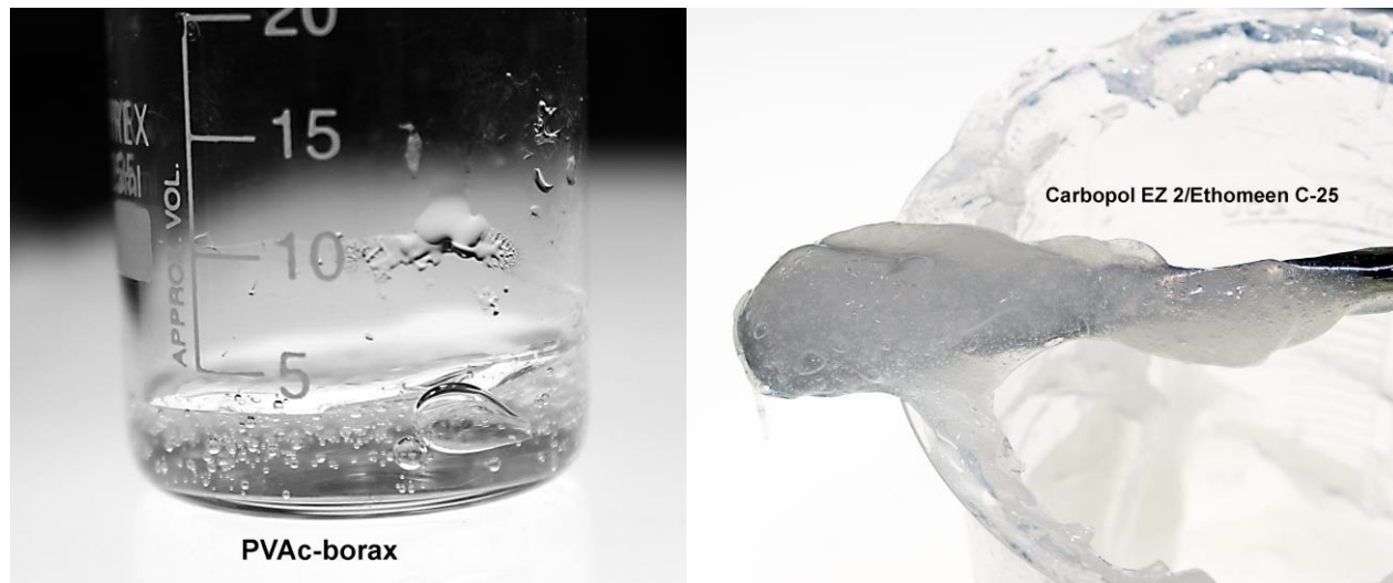
Figure 1. Freshly prepared PVAc-borax and Carbopol-Ethomeen.

[TEA]) after a recipe by Stavroudis [14], and 80% hydrolysed poly (vinyl acetate) (PVAc)/borax (5 wt.%/1 wt.%) according to Angelova et al. [15] (Figure 1).