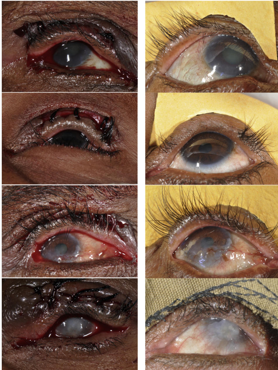
Figure 1. Immediate postoperative undercorrection. Left: Immediate postoperative pictures of patient with central undercorrection. Right: The 12-month follow-up pictures of the same eye showing postoperative trichomatous trichiasis (PTT) at the same area.

factors are probably vital in shaping trichiasis surgery outcomes.