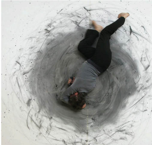
3 Em[bed}ding circle