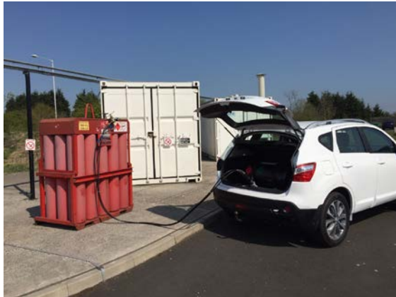
Figure 1: The vehicle being refuelled from manifold cylinder pack (MCP)

hydrogen. This was chosen due to the similarities between CNG and Hydrogen (as opposed to LPG) and to keep costs as low as possible. This was coupled to a Dynetek DyneCell Cylinder, Model: V074H350X8N 74L (1.79 kg (@ 350 Bar) 350 Bar (5075 PSI) Hydrogen storage tank and a Dynetek BV351 Hydrogen solenoid valve. The Qashqai has eight injectors with an operating voltage of 3V. The gas injectors from Zavoli operated at 12V. This issue was overcome by using a separate supply for the additional injectors.