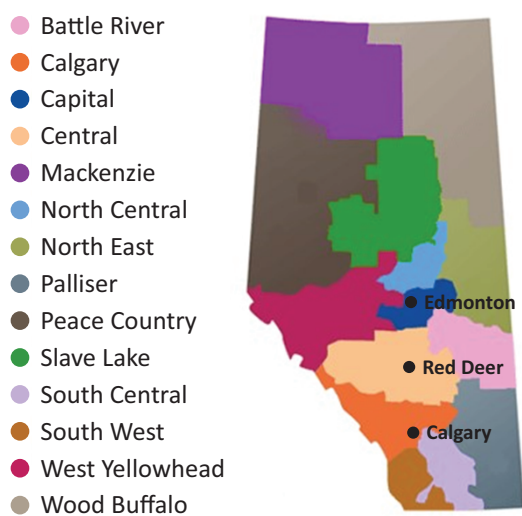
Figure 1. Alberta economic regions (2015).

Within these communities we identified and contacted key individuals in government and the local social services coordinating organizations which are allied with