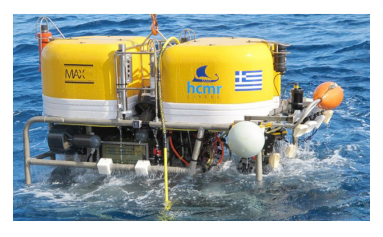
Fig 2. Recovering the ROV Max Rover (HCMR, Greece).

b) Remote operated vehicle (ROV) survey: Max-Rover is an underwater, remotecontrolled system to perform high-quality optical imaging, with a maximum operating depth of 2000 m (Fig. 2). It has 6 electric motors x 2.0 hp for a resulting underwater speed of approximately 2.5 knots. Average transect speed on the seabed would be approximately 800 m/hour. The ROV has several cameras, with a main HDTV full frame colour camera with zoom lens. Lights are 2 x 100 W HID and 4 x 150 W Quartz. The manipulators are 2 Hydrolek electro-hydraulic 5 function manipulators. Main sensors are pressure depth-meter, altimeter and digital compass. The positioning system is a Linkquest Tracklink USBL, georeferenced through Max-Sea software.