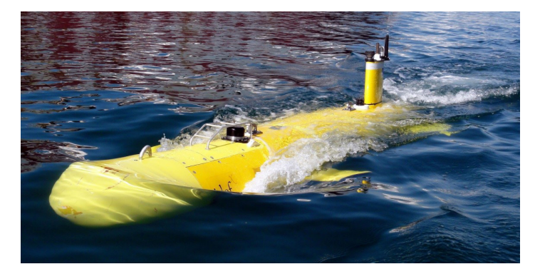
Fig 1. AUV IdefX (IFREMER, France) navigating at sea surface.

cific studies on seamounts, such as Cabliers Bank [3], to investigate deep-sea habitats associated to the active structures. To achieve such a high-degree of resolution we used cutting-edge techniques that allow a cm-resolution in surface mapping and profiling, and high-resolution video imaging.