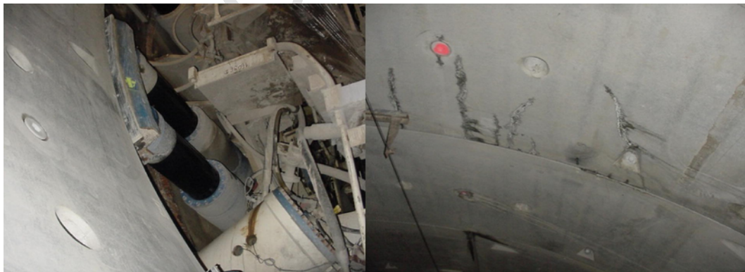
Fig. 3. Cracks detected during the installation phase involving ram thrusts.

While the current code permits the use of fibre reinforcement in structural elements and the solution has proven to be both technically and economically attractive in the segmental linings used in over 50 TBM tunnels built to date (de la Fuente et al., 2012b), some doubts still persist concerning the use of FRC in this particular application. These doubts are mainly due to the following two factors: (1) project planners have little technical knowledge of the use of this material; (2) existing studies that compare traditional and FRC solutions are based solely on direct material costs without taking into account either indirect costs or social and environmental factors, that is, without considering the sustainability of possible solutions.