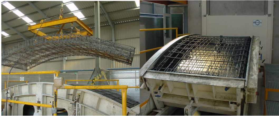
Fig. 2. Insertion of the pre-assembled reinforcement cage.

ments are subject to jacks' thrust during installation (Fig. 3) (Schnütger and Erdem, 2001; Cavalaro and Aguado, 2012; Tiberti and Plizzari, 2014).