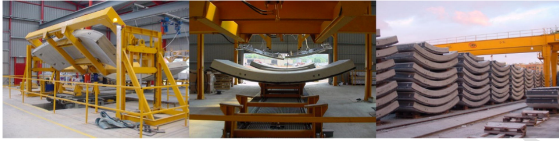
Fig. 1. (a) Demoulding; (b) transport and (c) stacking at the yard.