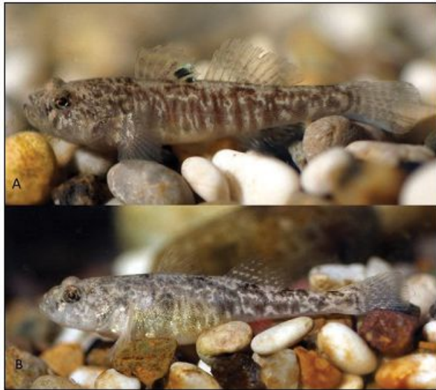
Fig 1. Male (A) and female (B) Orsinogobius croaticus (photo by Perica Mustafić, June 2006)

lower Neretva drainage catchments in Croatia and Bosnia-Herzegovina, including the Trebižat River, Bregava River and Hutovo Blato wetland (Mrakovčić et al., 2006; Šanda and Kovačić, 2009) (Table 1). It should be noted that no individuals have been recorded in Modro Oko Lake since 1997, and it is believed that prior reports were the result of incidental translocation via subterranean water flows from the Neretva River.