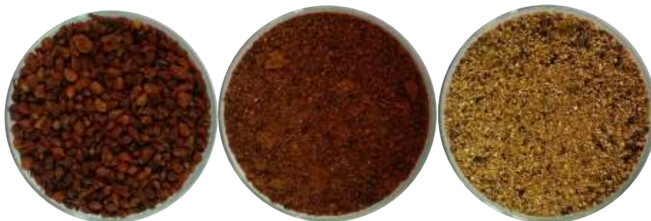
Fig. 1. Sea buckthorn (from left to right): a) purchased dried berries b) grinded dried berries before SFE extraction c) defatted cake after SFE extraction

Dried SBT berries (Fig. 1a) were purchased from „Planet Health“, the supplier, on-line store for food supplements and Eco products. Country of origin these dried berries was Germany. The purity of CO 2 used for extraction was 99.97% (w/w) (Messer, Osijek, Croatia). Industry FAME mix 37 standard for fatty acids was purchased from Restek (USA). \alpha -tocopherol (Dr. Ehrenstorfer Cat No. 17924300), \beta -tocopherol (Supelco Cat No. 46401-U), \gamma -tocopherol (Supelco Cat No. 4-7785) and \delta -tocopherol (Supelco Cat No. 4-7784) were used. All other solvents were of analytical grade and purchased from J.T. Baker (PA, USA).