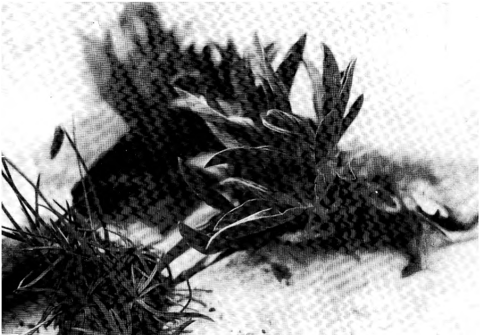
Fig. 3. Convolvulus lineatus L.