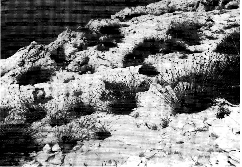
Fig. 2. The habitat of Convolvulus lineatus L. in Istria