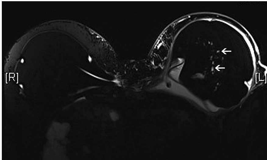
Fig. 3. Magnetic resonance imaging showing breach of the envelope at the deep aspect of the implant. Multiple areas of water signal content are noted within the silicone in the implant.