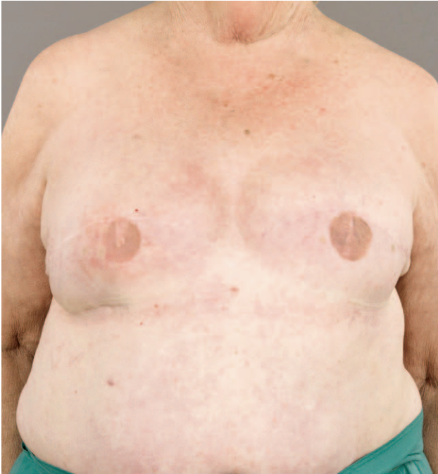
Fig. 1. Follow-up picture obtained weeks before the onset of symptoms.