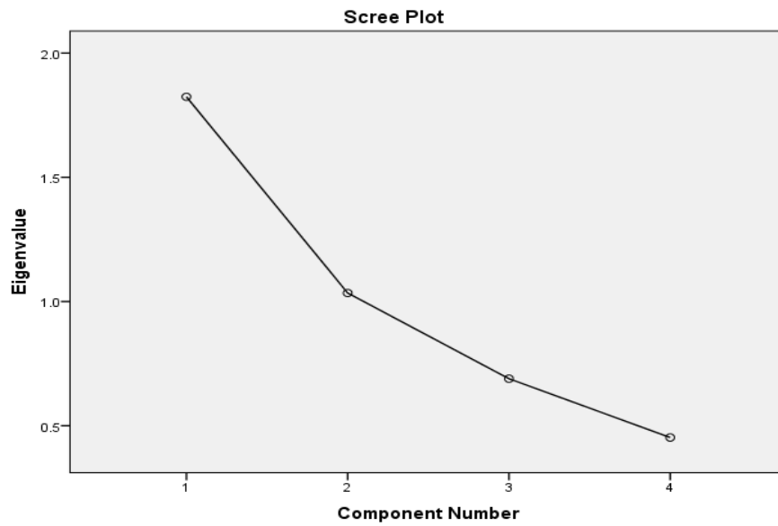
Figure 2. Factor Analysis for Category of Immigration to Physical Activity Change