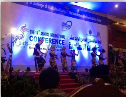
Authors photos taken in Balikpapan, December, 2014.