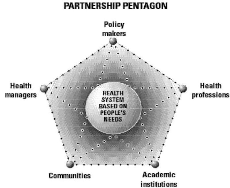
Figure 20. The partnership pentagon (Boelen, 2000)