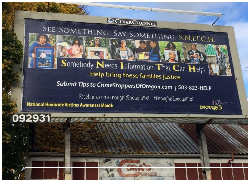
Figure 2 Enough is Enough PDX Billboard (Bernstien 2015)

“We are a supporter of the community-lead campaign but it's the citizens that are driving the process of Enough is Enough. They're going after their 501-C3 status now so they can hold money.”