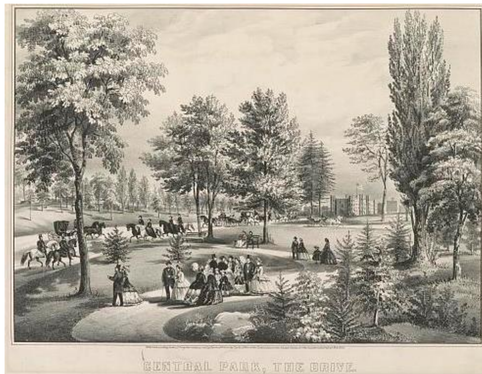
Figure 2: Despite discussion of Central Park being a park for all New Yorkers, rich and poor, elite uses of the space continued to dominate park use. Currier & Ives, “Central Park, The Drive,” 1862 [Courtesy of the Library of Congress]

needed to delineate clear restrictions on the appropriate use of land. No longer could people turn cattle, goats, horses, or swine out in the park to graze. Similarly, administrators made hunting illegal by restricting visitors from carrying firearms. Park visitors were meant to appreciate but not use the park's resources. Olmsted and the commissioners added new ordinances as necessary, such as the law against picking flowers, fruit, and nuts, the law against annoying birds, and laws preventing people from bathing and fishing in the park's lakes and ponds. xxxvi