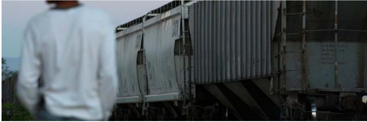
Migrants in Central America take on 'The Beast'.

After visiting Mexico, Trump ridiculed Peña Nieto in his infamous Phoenix speech on immigration policy. He smugly used the Mexican president to boost his campaign. His major triumph, however, was the adoption of his views on immigration by the Mexican government.