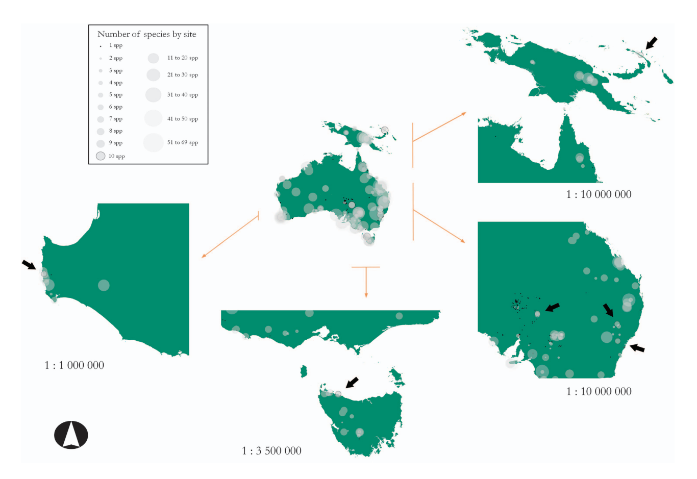
Figure 2. Distribution of cave/site/deposits within Sahul, with proportional circles showing the number of different taxa found per site. Each circle represents a single site. Legend symbol size depends on the scale of each map. Black arrows indicate outlined circles corresponding to sites with 10 species; these circles can be used as a reference scale.