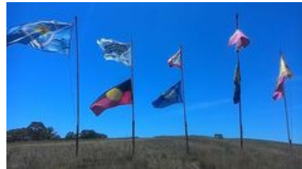
The Aboriginal flag flying in solidarity at the Sacred Stone Camp, North Dakota, USA.

Social media has helped the Standing Rock Sioux Tribe attract national and global support in their fight to protect sacred sites and water supplies from a 1,900 kilometre pipeline, expected to carry 470,000 barrels of oil a day just north of their reservation. (Follow the latest #NoDAPL developments on Twitter, YouTube, Medium, Instagram or see the Aboriginal flag flying at the Sacred Stone Camp via its Facebook page.)