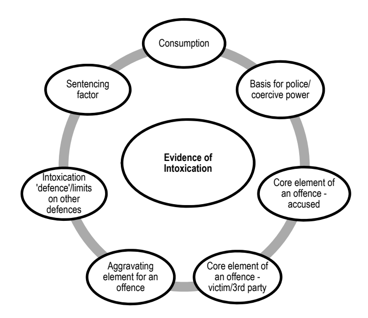
Figure 1: Purposes for which Criminal Law Statutes Attach Significance to Intoxication

The second dimension involved identifying the major 'sites' in which criminal law-intoxication provisions operate. For our purposes, 'site' is an amalgam of a number of considerations including location, activity and rationale. Four primary sites were identified which were defined at a high level of generality as follows: